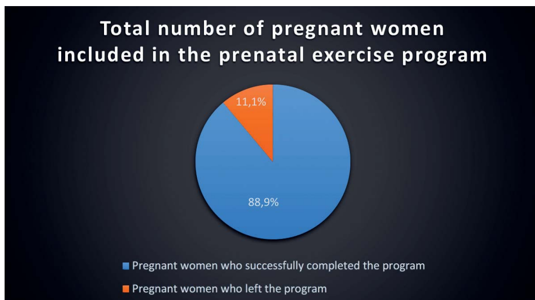
Chart 1. Total number of pregnant women included in the prenatal exercise program

A total of 135 pregnant women were included in the prenatal exercise program of which 120 pregnant women successfully completed the program (88.9%), while 15 pregnant women (11.1%) left the program (Chart 1).